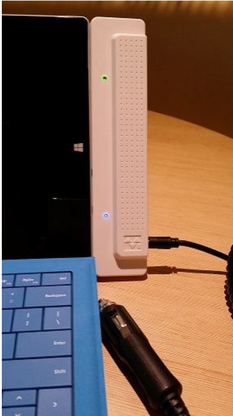
Photo 5: Car charging application. Blue light indicates charging function detected.

6) Car charging function: An optional car charger allows users to charge their SP3 in their vehicle. Microsoft's dock does not allow charging in a vehicle without an inverter and too bulky to use it in a vehicle. Microsoft's dock is suitable for indoor desktop application.